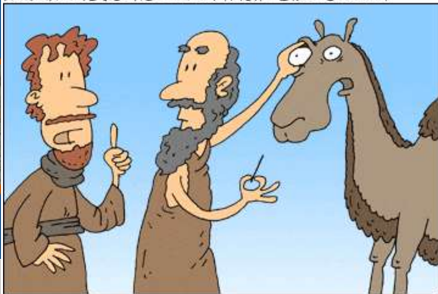
(See Mark 10:25)